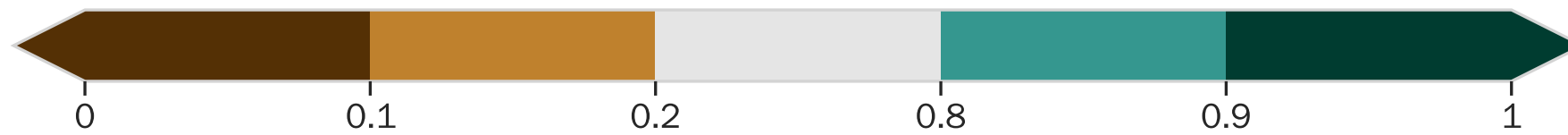
Precipitation quantile relative to 1991-2020